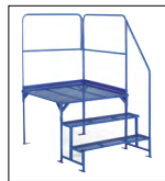
1000 x 1000mm platform