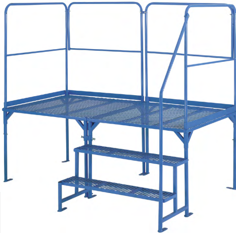
2000 x 1000mm platform