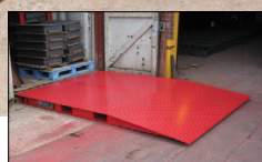
Platform and ramp only