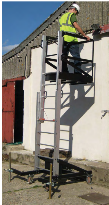
3.9m max. working height