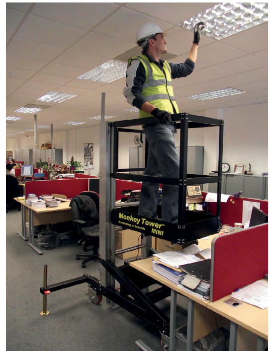
Over desk access