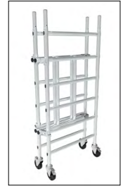
Folds away for easy storage and transportation.