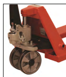
Sealed hydraulic pump unit