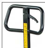
3D handle with control lever