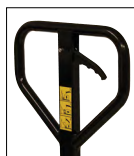
Three position control handle