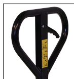
Three position control handle