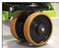
Polyurethane tyred steering wheels