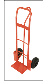
Without rail guards