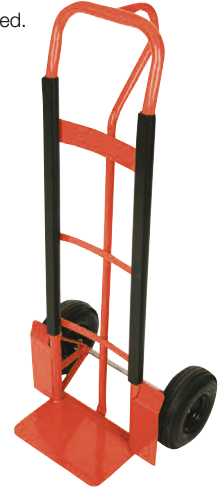
With rail guards