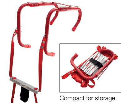
Compact for storage