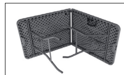
Folds in half