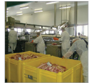
Used in food processing