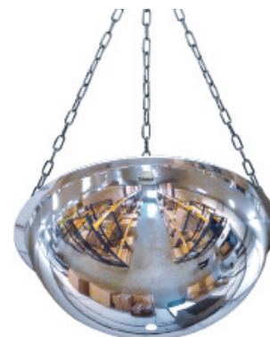
Full dome with chain