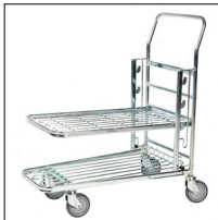
Height adjustable shelf