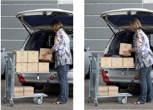
Spring loaded shelf maintains a constant height when loading/unloading