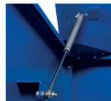
Gas strut lift