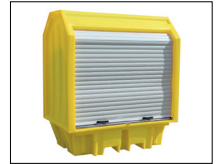
Roller shutter door