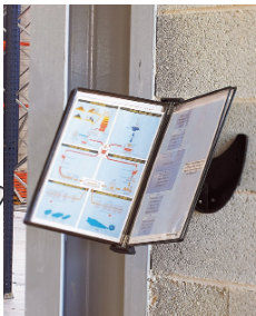
Desk mounted Wall mounted