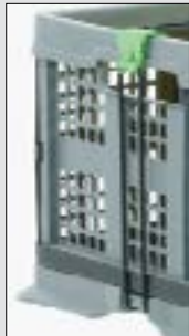
Elasticated box strap