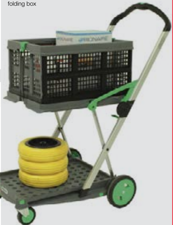
Folding trolley + box