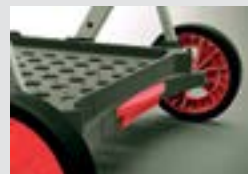
Single pedal breaking system