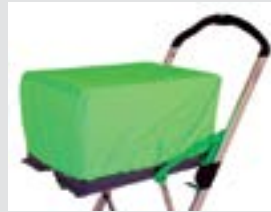
Dust/weather cover for Clax folding box