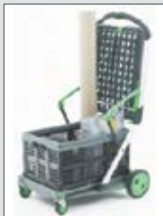
Hinged upper tray