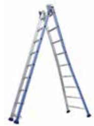
2 section, 2x9 rungs

Meets EN131 Professional (2018) standards