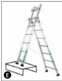
2 section stair ladder