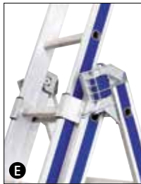
Automatic-locking articulated hinge