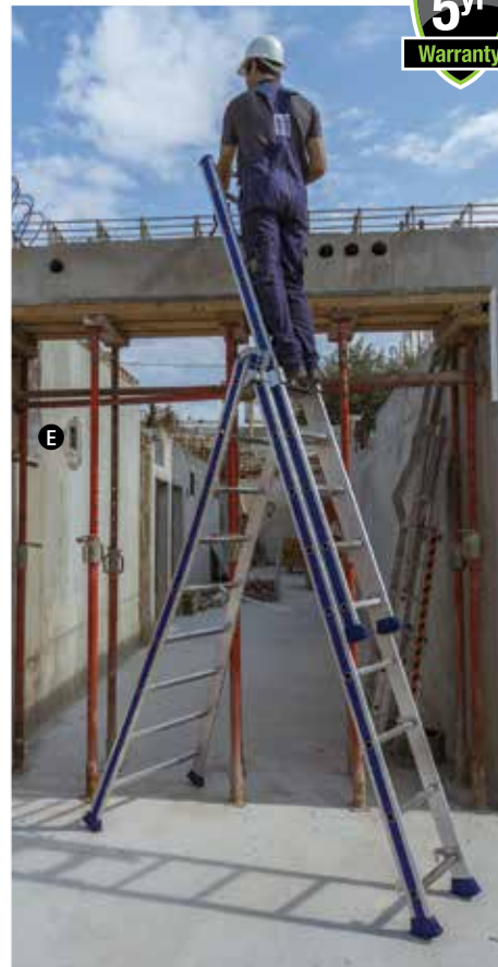
3 section, 2x9 rungs