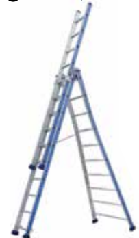
3 section, 3x10 rungs