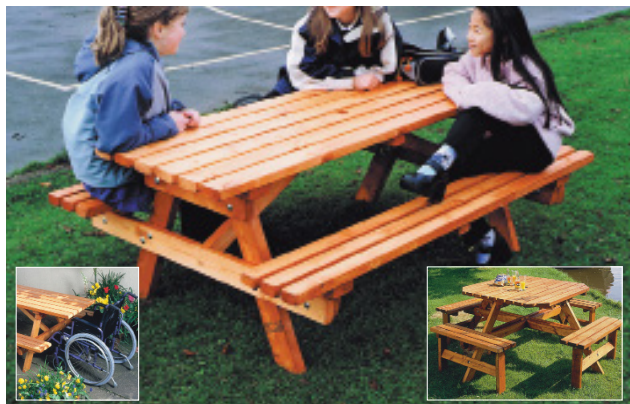
Disabled access picnic bench (359681DX8)