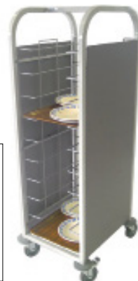
With side panels