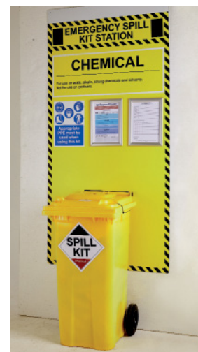
Wheelie bin board