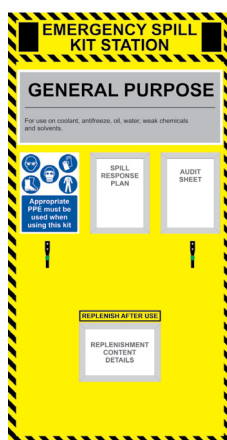
Grab bag board