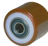
Polyurethane tyred rear roller with nylon centre (15)