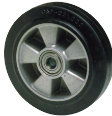
Rubber tyred steering wheel with aluminium centre (12)