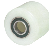
Nylon rear roller (14)