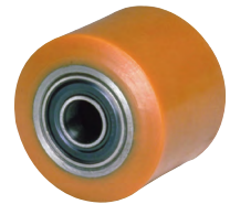
Polyurethane tyred rear roller with steel centre (16)