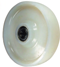
Nylon steering wheel (1)