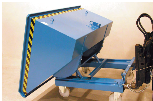
Skip fitted with optional castors