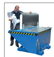
Skip with optional lid