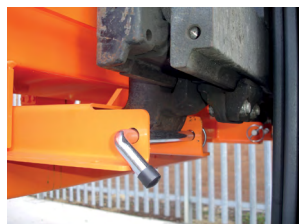
Zinc plated heel pins