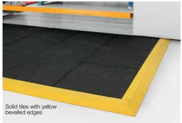
Solid tiles with yellow bevelled edges