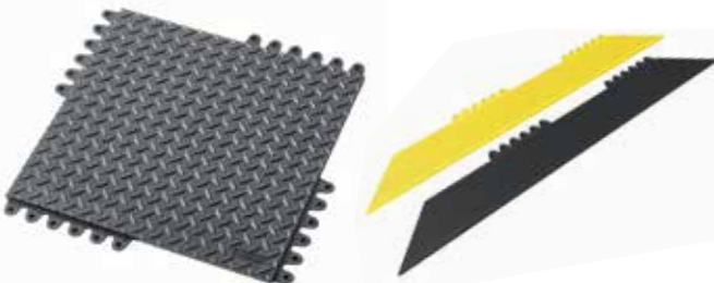
F Checker plate rubber tile