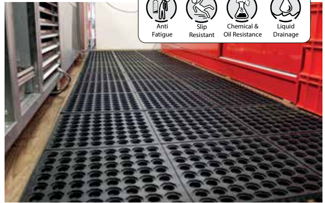
Open grid tiles