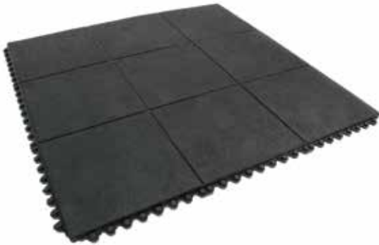
9 x solid surface tiles