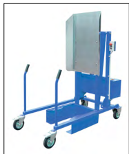
12V battery powered