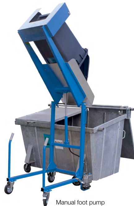
Manual foot pump