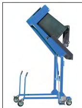
Manual hand pump