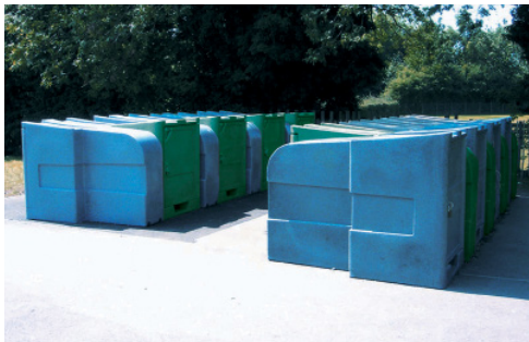
Lockers nest together for a smaller footprint