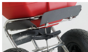
Directional flaps open to increase the spread