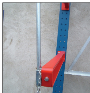
Arm end stop