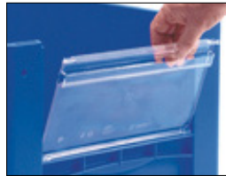
Window for extra large picking bins