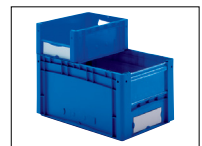
400 x 300mm on top of 600 x 400mm