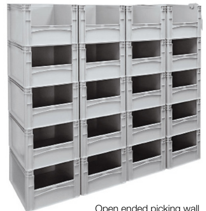
Open ended picking wall