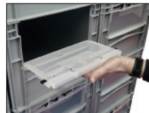
Translucent removable window