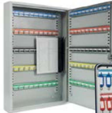
Square corners on 100-300 keys