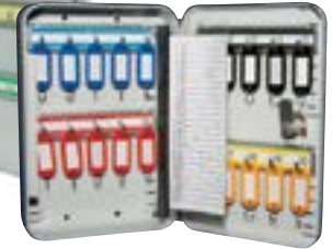
Round corners on 20-84 keys