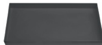
Lift out sump