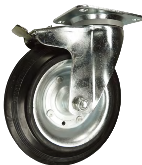
Swivel with total-stop brake (A2)