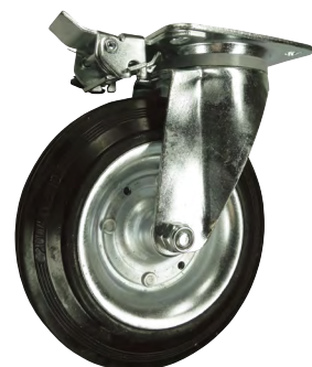
Swivel with 2-directional lock (A3)