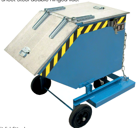
Skip with optional split lid fitted