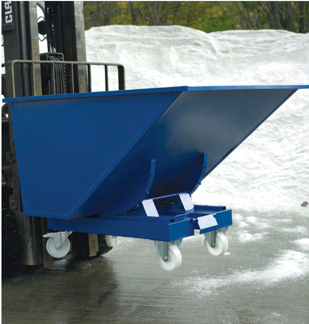
Universal tipping skip with optional nylon castor set