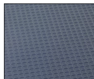
Premium slip resistant rubber surface