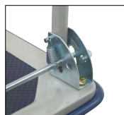
Sturdy, reinforced handle bracket