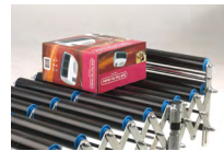
End stop rollers