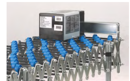
End stop plate