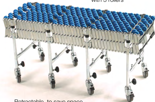
Retractable, to save space