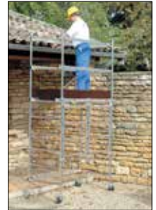
Mid height platform