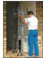
Fits through doorways