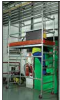
Through trapdoor entry