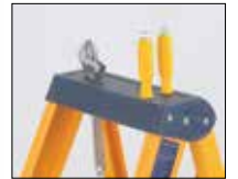
In-built tool holder