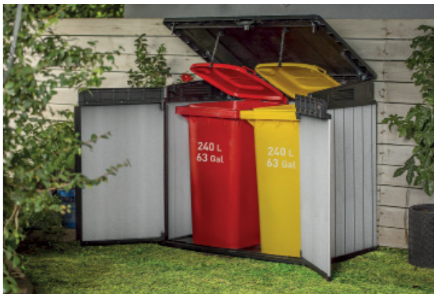
1150L Heavy duty large storage box