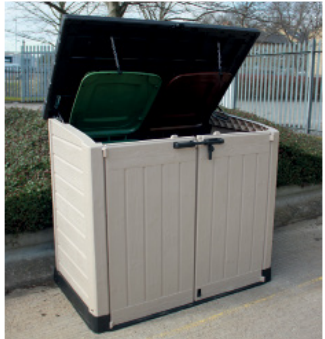
1400L Heavy duty large storage cupboard