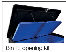
Bin lid opening kit