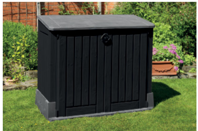
845L Medium storage box