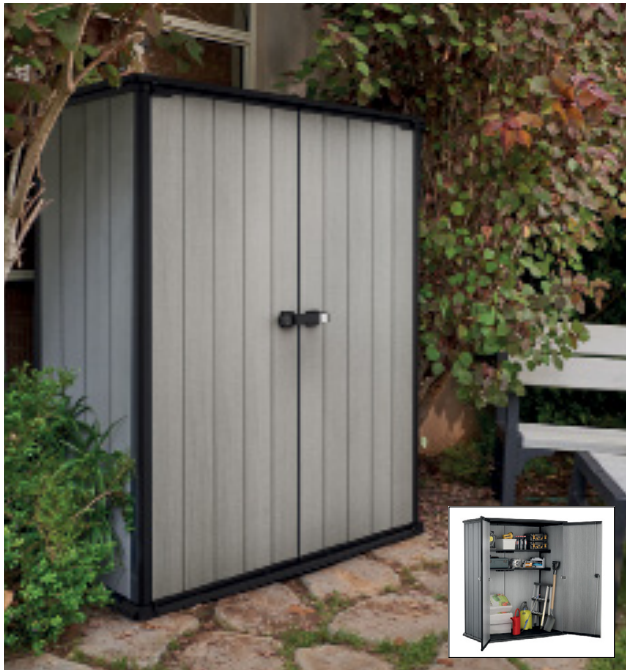
1200 Large storage box