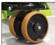
Polyurethane tyred steering wheels