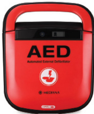
Mediana A15 HeartOn AED