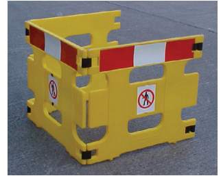
Chapter 8 Barrier