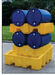
Sump base with optional upper rack