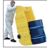
One man operation