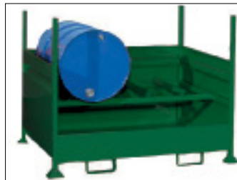
2 drum pallet