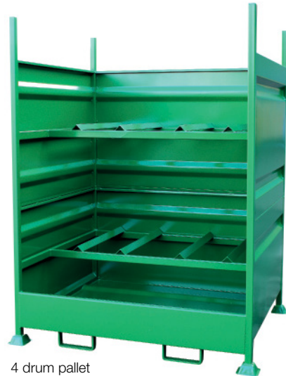
4 drum pallet