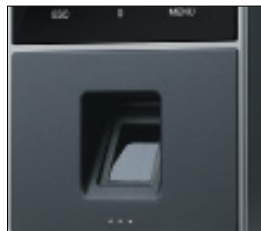
With fingerprint recognition