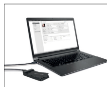
Desktop RFID reader