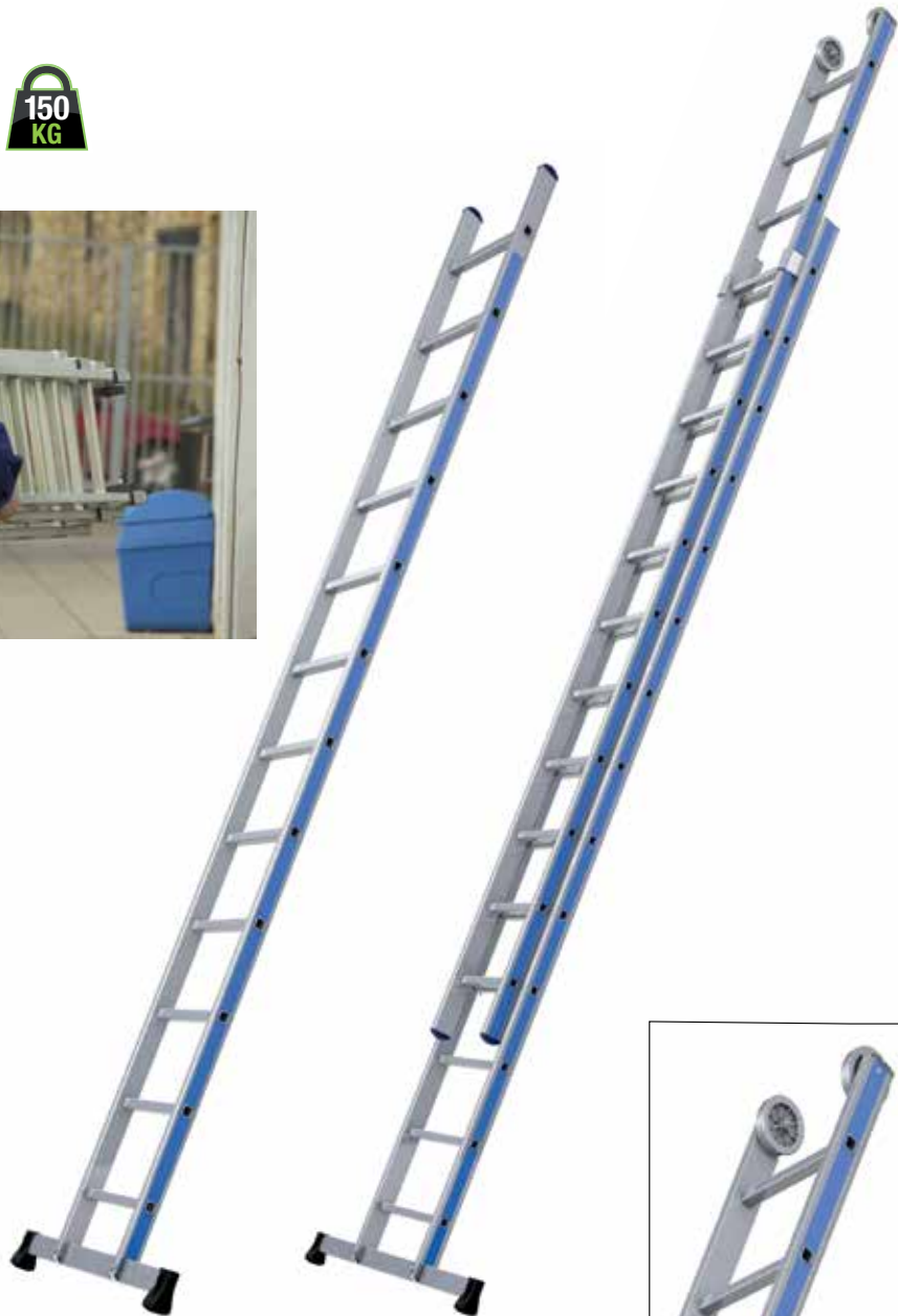
Single section, 12 rungs

Square profile rungs for extra grip and comfort