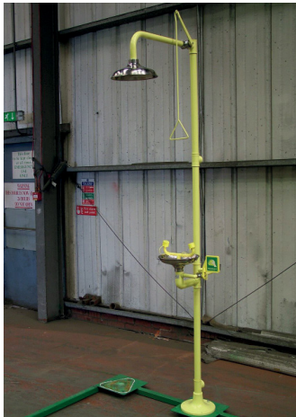
Freestanding stainless steel