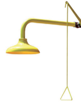
Wall mounted ABS plastic