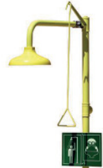
Freestanding ABS plastic