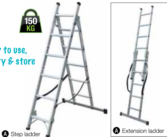
A Step ladder