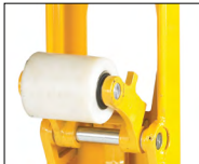
Rear rollers with guide wheel