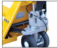
Sealed hydraulic pump unit