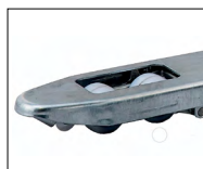
Tandem nylon rear rollers, with guide wheel