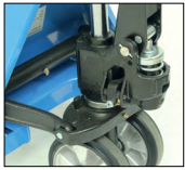
Sealed hydraulic pump unit