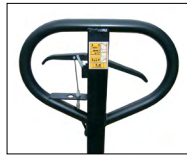
Three function handle with brake