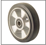
Rubber tyred steering wheels