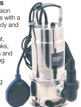
All stainless steel body