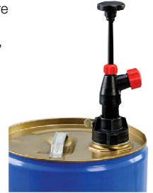
Lift pump with nitrile seal