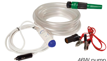
46W pump kit