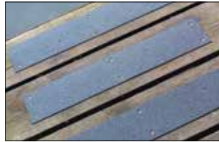
D Flat cleats