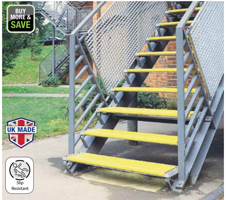
Treads with 20mm nosings