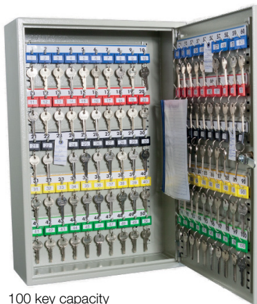
100 key capacity