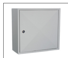
Cylinder key lock