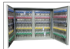
200 key capacity