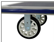
Silent, non marking polyurethane wheels