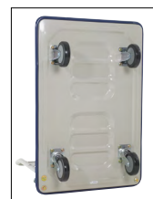
Double reinforced super structure