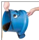
Easy to empty