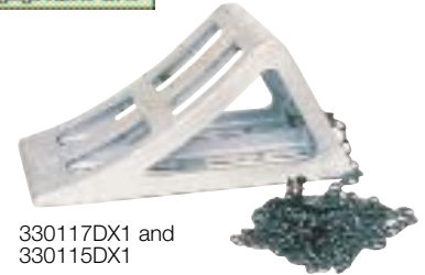
330117DX1 and 330115DX1