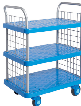
Trolley with mesh ends