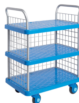
Trolley with mesh side and ends